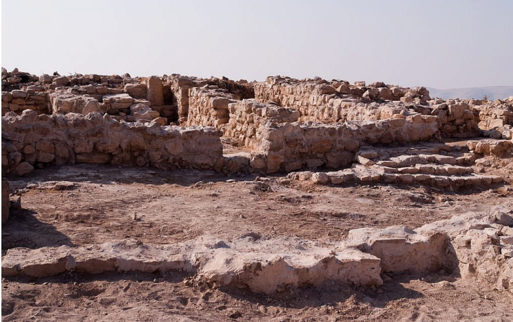
• Moabite sanctuary and stepped structure at the Khirbat Ataruz site in central Jordan.