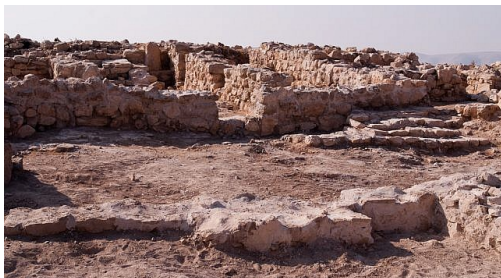
Moabite sanctuary and stepped structure at the Khirbat Ataruz site in central Jordan.

In terms of both content and language, the new inscriptions represent a missing link between the Mesha Stele and later Moabite texts such as the Khirbet Mudineyah Incense Altar.