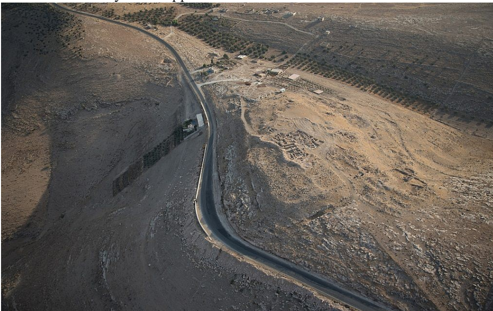
• Aerial view of the Khirbat Ataruz site in central Jordan.