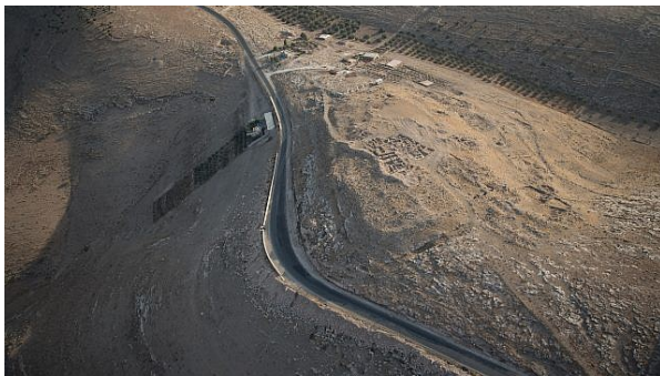
Aerial view of the Khirbat Ataruz site in central Jordan.